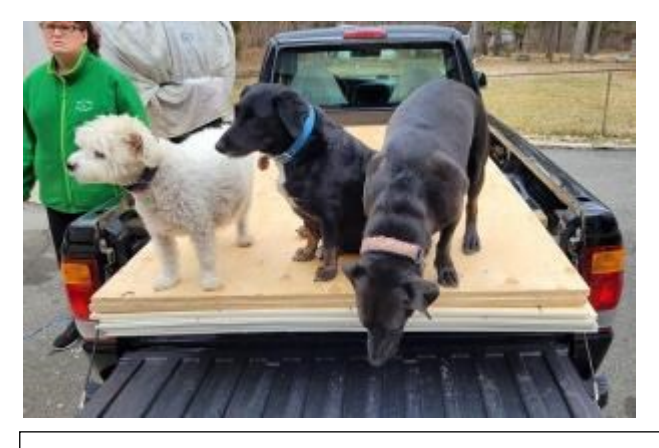
The Higgins clan approves