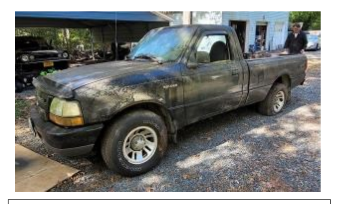
October 11, 2023 after sitting for 13 years

Arnie was attracted to the '58 Plymouth Fury in the movie Christine. I was hopeful that there was no nefarious past with the Ranger, though. The last registration sticker on the Virginia license plate indicated After negotiating with the owner, I bought the Ranger nificant body damage, even the rockers looked good. The doors were unlocked and as I peered inside I liked what I saw. Although filthy, the interior was intact - no rips or tears in the upholstery and every-