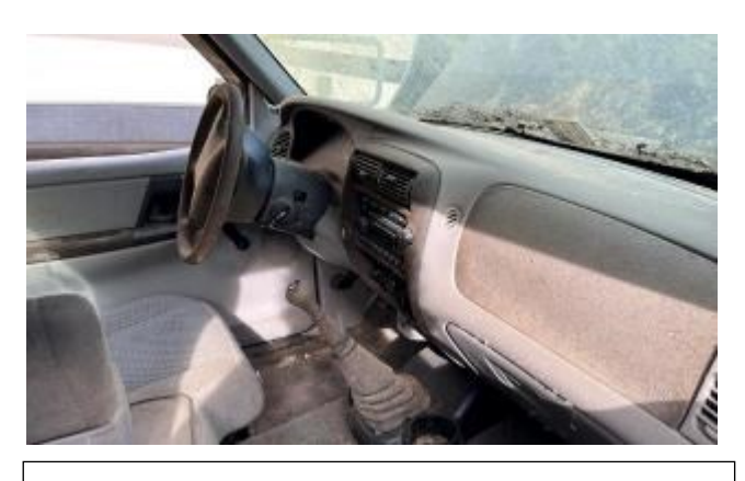
After sitting for 13 years

that it expired in February of 2011. A quick scan of for $700.00 and on October 23, 2023, fellow Bull the exterior showed no indication of rust and no sig- Run Region member Bob Drake and I picked it up