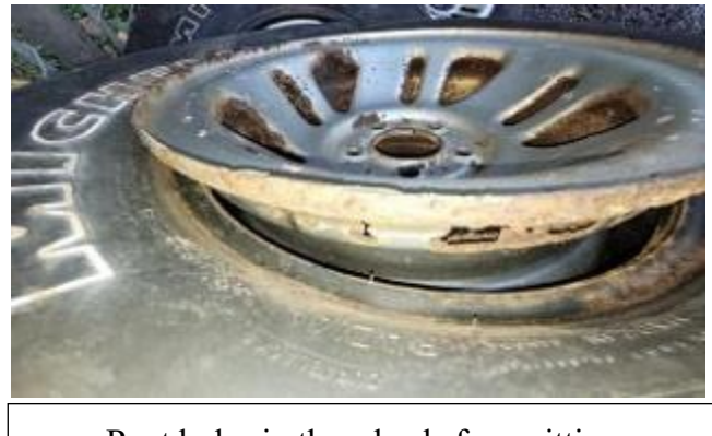
Rust holes in the wheels from sitting

Upon arriving at my house in Manassas it was necessary, due to the tires being almost square from sitting for so long, to unload it by chaining it to a tree and driving the trailer out from under it..