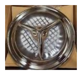
A set of 4 Brand New Vintage 15 Inch Oldsmobile Spinner "Flipper" Hubcaps for $150.