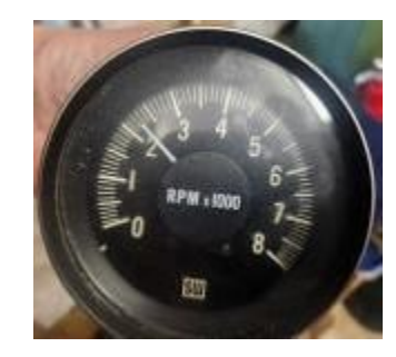
Assortment of 8 VDO and Stewart Warner Gauges $100