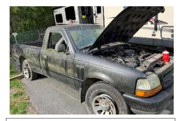
First day working on the Ranger

using Bob's car trailer. With four flat tires it was quite a strain on his winch trying to load the Ranger until we realized the parking brake was still applied. It went a lot smoother after releasing the brake. The thing was there including the factory AM-FM radio owner was a mechanic and told me that the Ranger with CD player. I'm not an audio guy, so I loved the had been parked in 2010 due to the fuel pump failing. fact that it didn't have a modern stereo hacked into Instead of fixing it, he parked it and bought a new the dash. It had A/C, manual windows, manual door truck. Personally, I think replacing the fuel pump locks, and a 5-speed. Upon opening the hood I could would have been cheaper. The odometer was show-