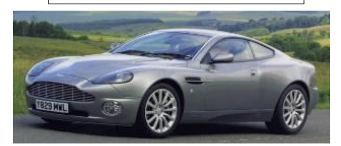
Aston Martin Vanquish V-12