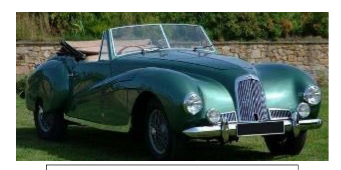
1950 Aston Martin DB1

Since then the company has been able to use that hint of glamour to survive as an independent manufacturer in an increasingly competitive marketplace.