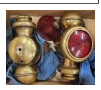
A pair of Original Tall Model T Cowl/Tail Lights – Brass and converted from gas to electric for $175