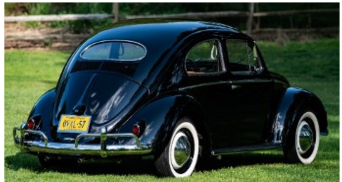
March COM—1957 Volkswagen oval window

Featured in March was Mike and Fran’s beautiful 1957 Volkswagen Beetle with an oval rear window. Mike and Fran found their car for sale in 2017 at the 2017 Bugout in Manassas. After a good inspection and test drive, the car was added to their collection of cars. They named the car Abbey Road, synonymous with another famous Beetle, but the car was showing its age. They took on the project of restoring the car to original condition.