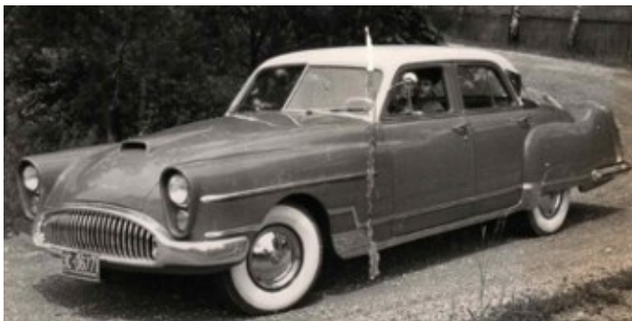
August COM—1950 Chrysler Spohn conversion

This was quite a car even though the styling was a bit conservative. The interior was unique as it was the first car with a padded dash. There was an instrument pod in front of the steering wheel and the rest of the dash was covered in stunning chrome. In June 1953 off went the Chrysler to Spohn for radical front and rear end custom work. That year we drove to France to see the Le Mans race and on the way people asked if the car was going to be in the race!