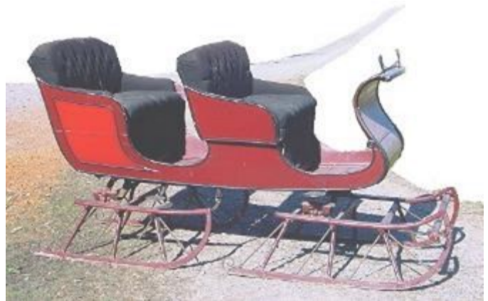
1837 Studebaker Sleigh