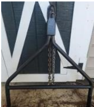
A heavy-duty car/truck tow bar for $50