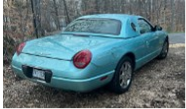
September COM—2002 Ford Thunderbird

In September we featured Steve Deitz's 2002 Ford Thunderbird. In 2002, Ford released the reimaged Ford Thunderbird, complete with rounded European lines, the iconic port-hole side window, hard and soft tops, and a hood scope, bringing back those features that make the 1955 - 1957 Thunderbirds so desirable. The 2002 Thunderbird was released with great fanfare and was named the Motor Trend car of the year in 2002.