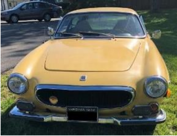
July COM—1972 Volvo 1800 ES

making 125 horsepower. This engine is mated to an M41 manual, four-speed transmission with a Laycock de Normanville overdrive. It is equipped with four-wheel disc brakes, weighs 2690 pounds and is 171.3 inches long with a 96.5 inch wheelbase. This sporty shooting brake, as Europeans would call it, has a top speed of 113 miles per hour. Over its two year model run 8,077 vehicles were produced.