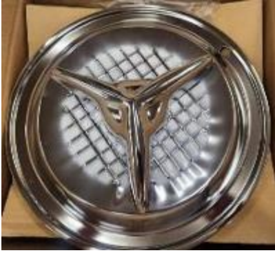
A set of 4 Brand New Vintage 15 Inch Oldsmobile Spinner "Flipper" Hubcaps for $175.