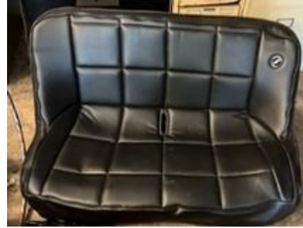
A new Corbeau 42" Baja Bench seat

If interested in any of these parts, contact Lou Realmuto at 4cruiserlou@gmail.com .