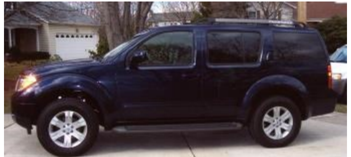
June COM—2006 Nissan Pathfinder 4x4 LE

The Pathfinder was as well appointed with a five speed automatic transmission, power disc brakes, power windows, power steering and dual zone air