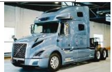
Volvo Semi Rig