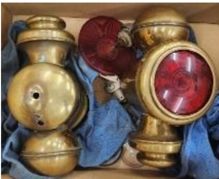
A pair of Original Tall Model T Cowl/Tail Lights – Brass and converted from gas to electric for $175