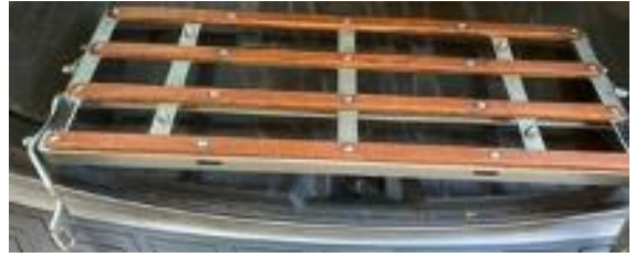
A Ford Model A Luggage Rack - Fits 1928 to 1931. Brand new $150.