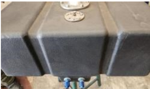
A JAZ Heavy Duty Plastic 16-gallon gas tank with two outlets for $150