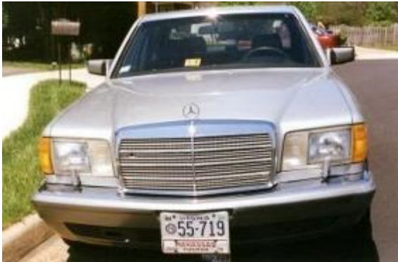
April COM—1987 Mercedes-Benz 420 SEL

with Mercedes nomenclature, 420 is the engine size, a 4.2 Liter V-8, SE, fuel injected sedan and L for long wheelbase. The SEL was the Mercedes top of the line, S Class, with only the 560 SEL rated above it. The car needed a little work, but not much, and