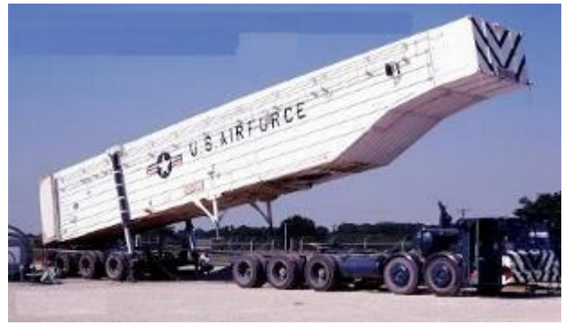
May COM—1961 Missile Transporter/Erector

The vehicle was 65 feet long, 10 feet wide and 13.5 feet high. It weighed 42,720 pounds empty and 124,945 pounds with a missile on board. It was powered by 702 cu. in. V-12 gasoline engine mated to a 15 speed manual transmission. Its maximum speed was 40 mph. In 1960, the unit cost was $1.3 million. Supporting six missile wings and one test facility, a