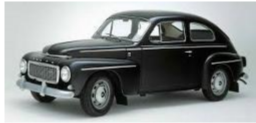
Volvo PV 444

in place but it gradually developed as more of a decorative symbol. It is still found across the grille of every Volvo vehicle. Today you will also find the iron