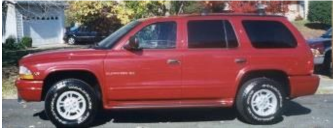
January COM- -2000 Dodge Durango SLT Plus

We begin our review with a 2000 Dodge Durango. While not an antique when the article was written, come next month it will be. This car belonged to