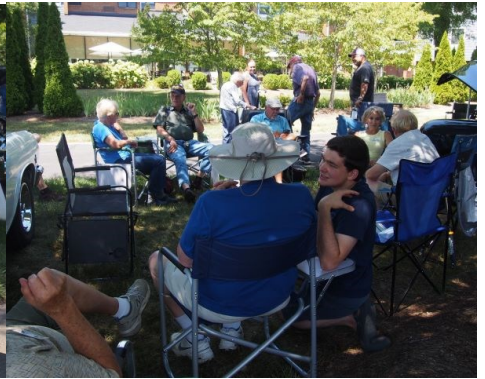
Our members enjoyed the shade.