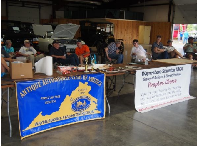
W-S Region Hosted our Annual Antique Vehicle display at the fair with 19 vehicles on the floor.