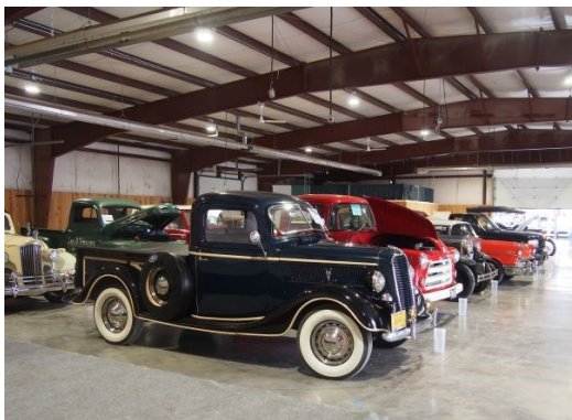
Members and Friends brought out a good a good variety of vehicles to show to Fair attendees.