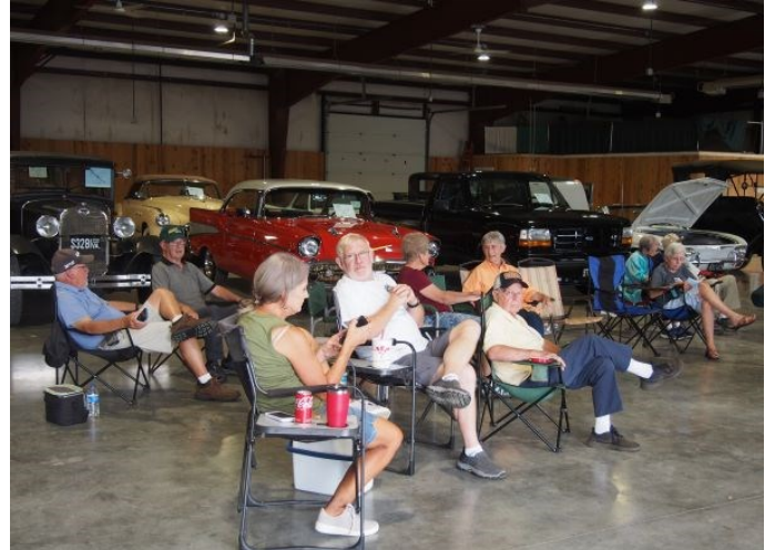
Members enjoyed the indoor facility with lots of time for relaxing and fellowship.