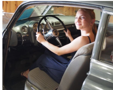
This young lady came all the way from Germany and got her picture in your Editor's 1949 Buick.