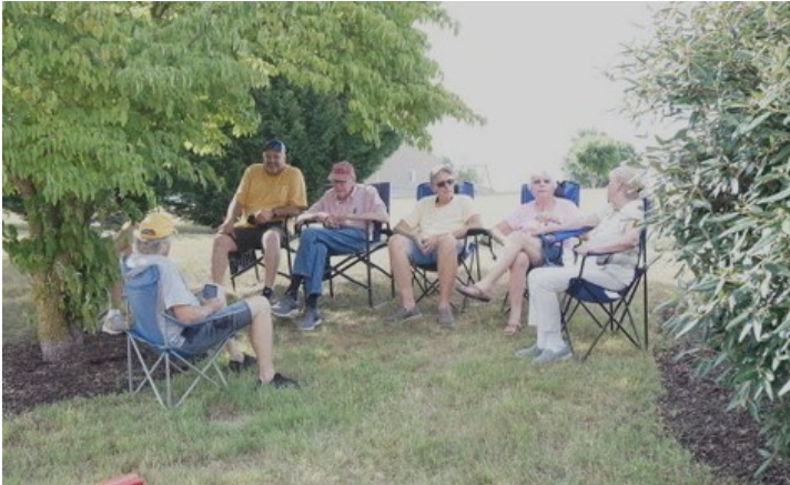
W-S members enjoyed the good weather and ice cream at our Annual Display at Stuarts Draft Retirement Community.