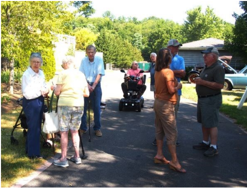
Residents were out in force to see our vehicles.