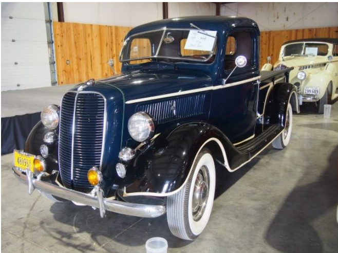
Paul Day & Polly Belford brought their 1937 Ford Pickup.