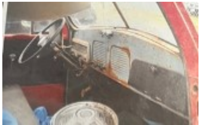
Found in a field in Mount Jackson, VA the truck was in bad shape.

to replace the rusted-out fenders, bed, and floorboards.