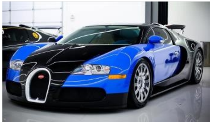
Contemporary Bugatti Veyron capable of speeds up to 250 miles per hour

On the car badge this logo stands in a red oval above "Bugatti" in white capitals with black drop shadow. The oval is surrounded by a silver rim containing 60 red dots. The origin of the dots has long been a mystery. Some say they represent small pearls, others that they link back to the red safety wires originally threaded through early Bugatti engines. Alternatively, they may be simply a decorative device employed by someone whose specialism was making jewelry.