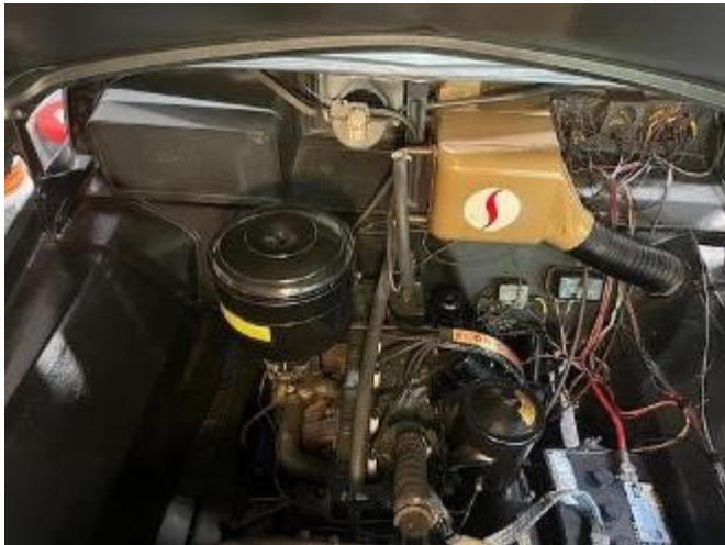
The 169 cubic inch straight six cylinder engine making 80 horsepower mated to a 3 speed manual transmission with overdrive

bring it along with my 1973 AMC Javelin and 2002 Ford Thunderbird. In addition to the Rohr show, I was able to show the car at the Fairfax car show and participate with it in the 2023 Manassas Christmas Parade.