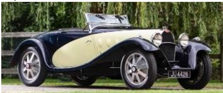
Bugatti Type 55

Editor's Note: Michael Schumacher was the first seven-time Formula 1 world champion racing driver. To date, his feat has never been bested and equaled by only one other driver, Lewis Hamilton.