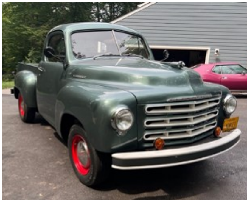
1953 Studebaker 2R5 Pickup Truck

Studebaker, started as a blacksmith shop in the 1850s, making covered wagons and carriages in South Bend, IN. Unlike other automobile manufacturers, Studebaker built a full line of electric automobiles, before switching to all gas-powered autos in 1911. In 1928, Studebaker purchased the Pierce-Arrow Company which expanded