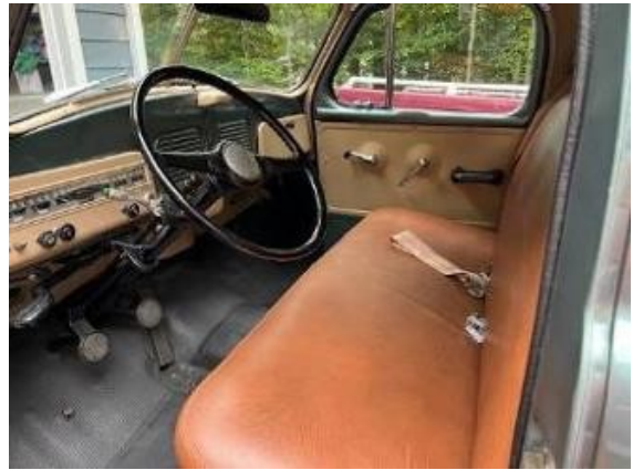
A much improved interior