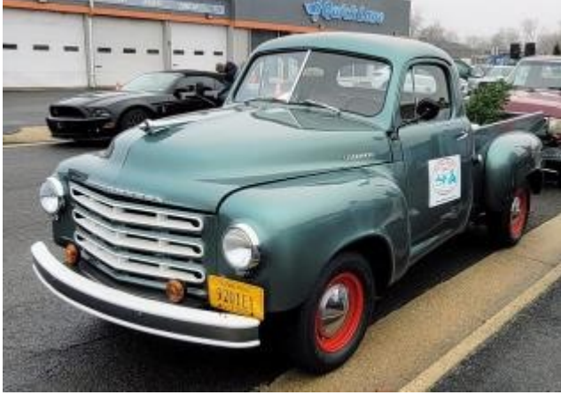
Studebaker at the Christmas Parade lineup

Last summer he made the difficult decision that it was time to sell the truck. As soon as I heard this, I jumped on the idea. He was happy to see the truck go to someone that would appreciate it and continue to maintain it as a classic antique truck. I picked it up just two weeks before the Rohr show and was able to