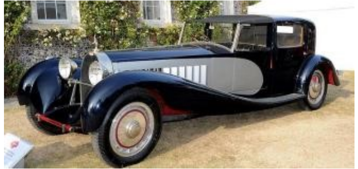
1929 Bugatti Royale sporting the longest wheel-base of any regular production automobile.

The Bugatti badge, however, has remained remarkably constant for more than a century. The distinctive symbol of the reversed "E" and "B" fused together was designed by Ettore's father. Ettore even used the logo on his personal set of cutlery.