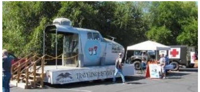
Freedom Museum B-25 nose and ambulance