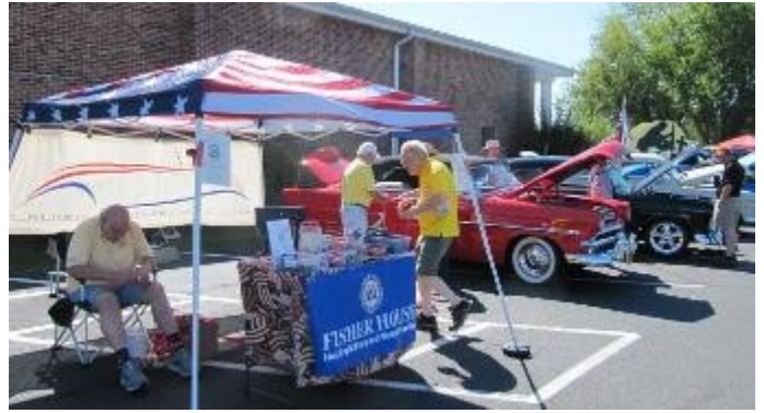
Crusin-For-Heroes display cars and tent