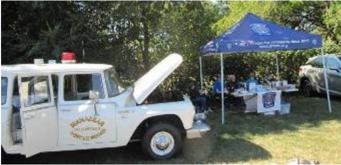
Freedom Museum B-25 nose and ambulance