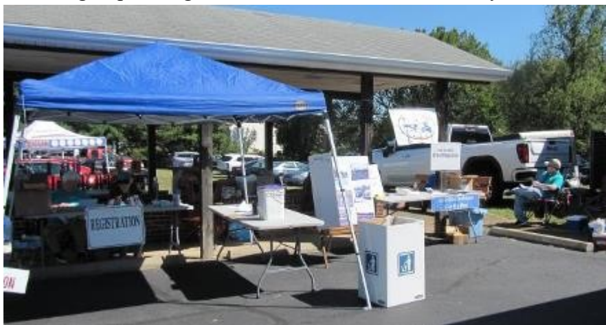
Bull Run Region administrative area