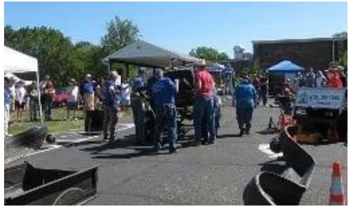
Freedom Museum B-25 nose and ambulance