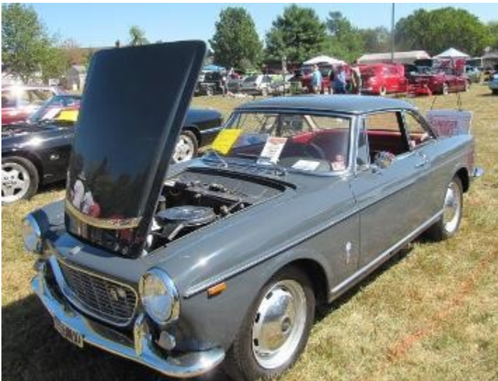
Rare Fiat—President's Award Winner