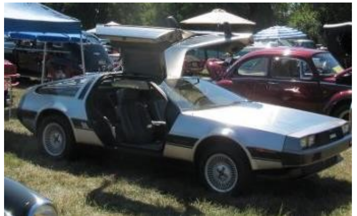
One of two DeLorens