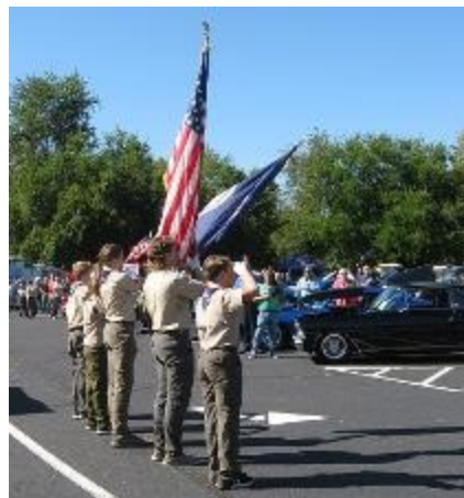
Scout Troop and Venture Club 670 present the colors