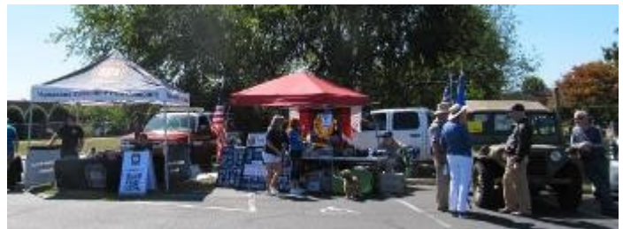
Manassas Volunteer Fire Company (left) and American Legion Post 10 (center, right)