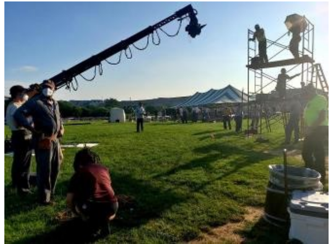
Scene from the set

The script for Rustin was written by Dustin Lance Black, who won an Oscar for his screenplay for 2008's Milk starring Sean Penn.