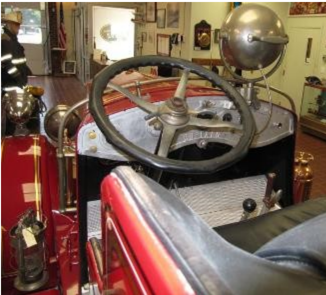
Simple dash and controls.

Still it was faster than the 1909 whether powered by Model T or horse. It was also capable of carrying