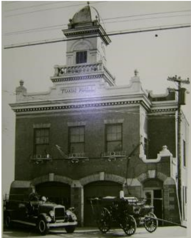
1929 and 1909 in front of old fire station