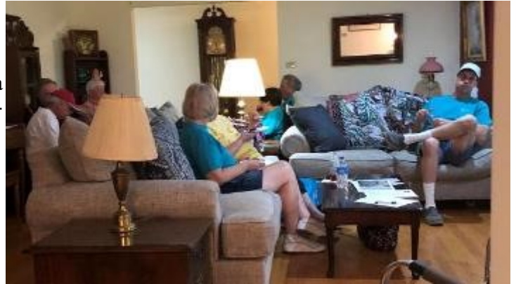
Bull Run members engaged in conversation

al cars from his collection. In the shop was a 1915 Ford Model T, a 1919 Ford Model T and a 1922 Ford Model T, three cars over 100 years old!