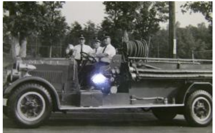
Lining up for a parade in the 1950s

The Fire Museum is open year round by appointment.