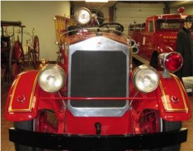
Front view with dash mounted spot light and engine crank

This new fire engine was powered by a six cylinder gasoline motor with a four speed manual transmission. It was capable of traversing the county roads, mostly still dirt, at a blistering 35 miles per hour.