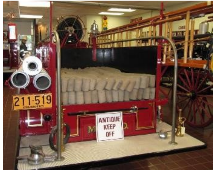
Rear view note hard suction sleeves and ladders mounted to the body sides

The engine used a power take-off to operate the 500 gallon per minute, rotary pump providing enough capability to operate multiple water streams. As with all engines even up to this day, it carried hard sleeve