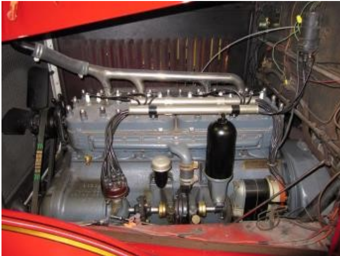
View of engine compartment