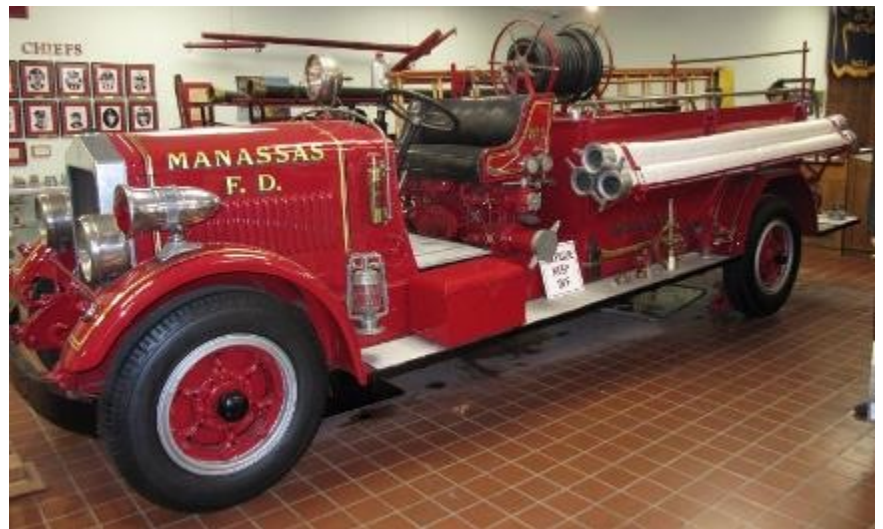
1947 Buffalo Pathfinder Fire Engine

The year was 1928 and Prince William County was growing. The town of Manassas was the county seat and the home of the only fire department in the county, the Manassas Volunteer Fire Company. Henry Ford had long since put America on wheels with his Model T automobile and had introduced in this year his Model A car. By this