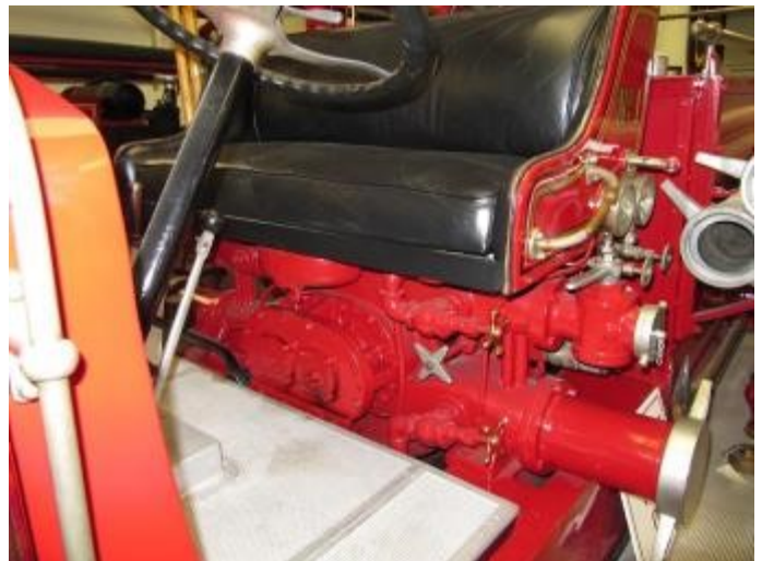
The rotary water pump positioned under the seat

This unit served Manassas and Prince William county for many years. In 1938, a second fire department was established in Woodbridge, which meant the Fire Company was now responsible for only the western half of the county. Also in 1938, with the anticipation of war, the Fire Company ordered a new engine, which arrived as a 1939 Chevrolet. This piece became the primary engine and the Buffalo was relegated to a secondary unit while the 1909 was put in storage.