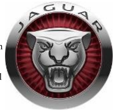
Current Badge and Logo

Drivers can still find the Leaping Jaguar on newer models, as a silhouetted badge-style version of itself placed on the driver's side and rear of the vehicle. Drivers will now find a circular Roaring Jaguar emblem front and center on the grille.