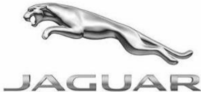
Leaping Jaguar Logo and Hood Ornament

1945 – The SS Cars Limited brand was renamed as Jaguar Cars Limited to establish themselves as a British brand while avoiding any confusion with the Nazi SS military group operating during World War II. The famous Leaping Jaguar logo was first introduced on hood ornaments. The brand kept the style unchanged until the early 2000s.