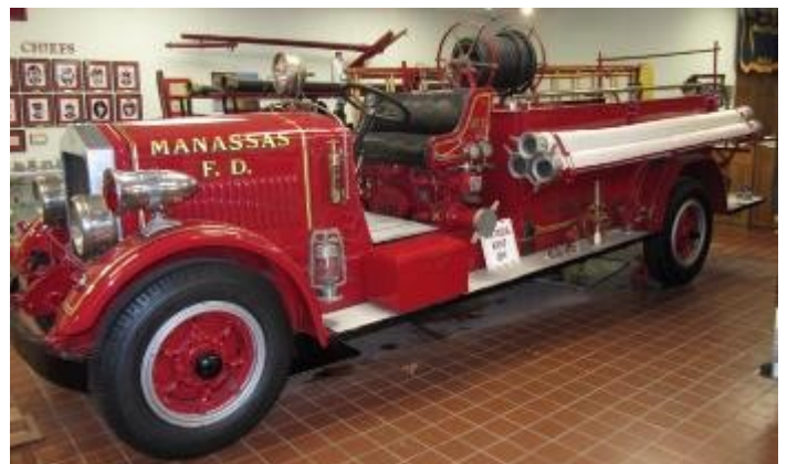
On display in the museum