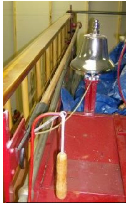
The 1929's warning bell

In 1992, as part of its centennial celebration, the Fire Company had the unit restored along with the 1909 engine to use as parade pieces. Both these engines are now on display in the Manassas Volunteer Fire Company Museum and are in running order. Well the 1929 is; the Fire Company has no horses.