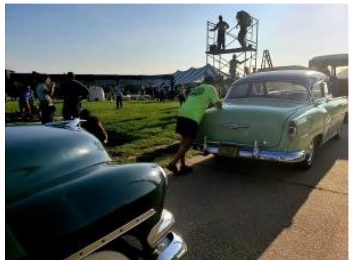
Staging of vehicles on the set

Rustin died in 1987 following a visit to Haiti, where he explored the possibility of democratic change in conjunction with a pending election.