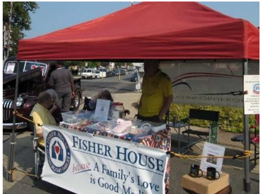
Crusin-For-Heroes fund raising tent at the show field entrance