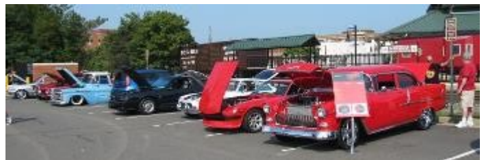
Line up of modified cars

An event of this magnitude could not happen without the help of many different people and organizations. Needless to say the Region is lucky to have so many active members who helped with the variety actions needed to put this show together. In addition to our