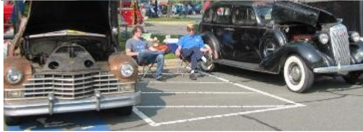
Vendors hard at work. Its okay, they are my son and son-in-law so I can tease them