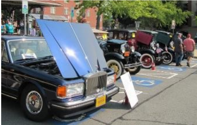
Line of stock cars in Manassas train station parking lot

The show is supported by Scout/Venture Troop 670 comprised of both boy and girl scouts. They serve as marshals for the parking of show vehicles, conduct the flag presentation at the opening ceremonies and select a vehicle for the Youth Choice award. The show also presents the Mayor's Choice Award, which is selected by a Manassas City representative,