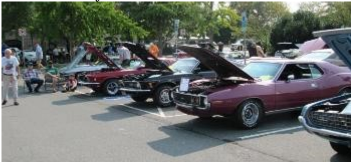
Stock pony cars on display