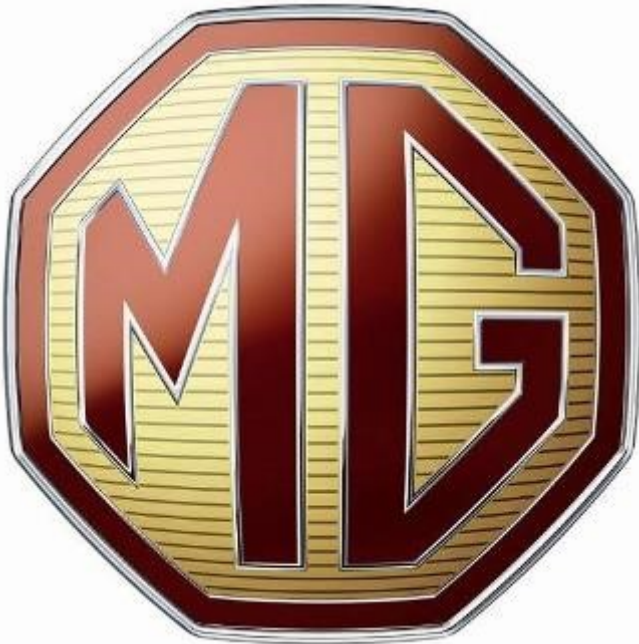
Badge design since 1924

One of the classic marques of the golden era of British motor manufacturing, MG started as a prewar sideline for a showroom called Morris Garages in Oxford. The garage began selling its own versions of some of the Morris vehicles produced by William Morris in 1924. These were adapted to be a little sportier than the standard cars. To emphasize the differences between the garages' own cars and the Morris originals, they were branded as MGs.