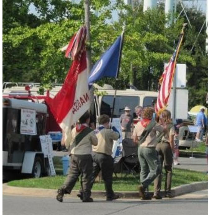
Scout Troop 670 presenting the colors

If you are familiar with the Ronald McDonald House program, Fisher House is basically the same thing but for military members injured in the line of duty. CFH is an informal group of predominately military veterans who are also collector car enthusiasts. They conduct various fund raising activities throughout the year using their automobiles to support car shows, parades and other community events. One hundred percent of all proceeds collected by CFH are given to Fisher House. Last year, the Rohr show raised over $1,300 for CFH, and this year's show did even better. We look forward to continuing this wonderful collaboration for such an important cause.