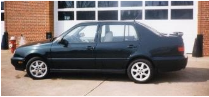
Profile view of the car

matic transmission. Pam could use a manual transmission just fine and had for several years, but she just didn't want to be bothered with shifting. The GLX was well appointed with heated leather seats, power windows and door locks, a sun roof, fold down rear seat with access to the trunk, and an AM/FM/CD stereo radio with a six CD changer and Bose speaker system. The space in the trunk was large for such a small car, but legroom, especially in the back seat, was cramped.