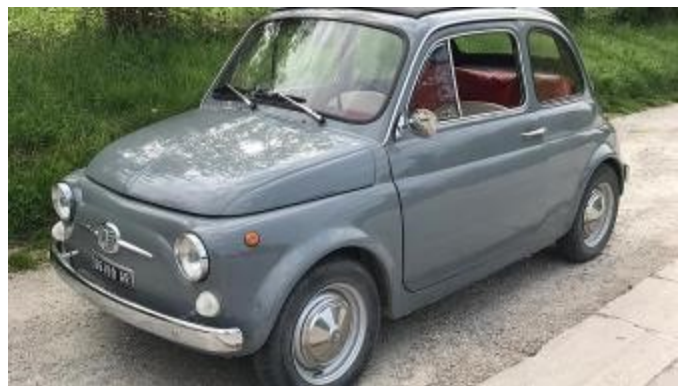
1950s vintage FIAT 500