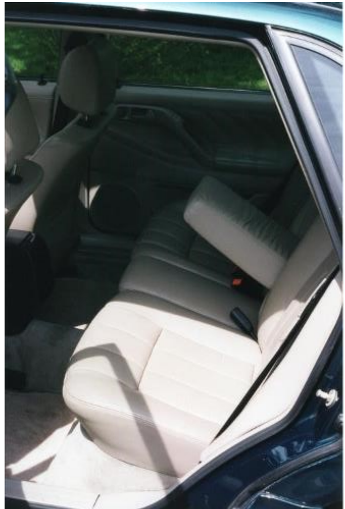
Leather interior front and rear