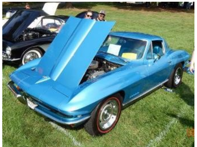
Mayor's Choice Award: 1967 Corvette