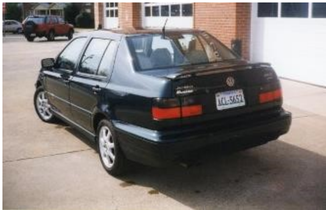
Rear view of the car

As you might expect, the Jetta was a lot of fun to drive, but it was clearly not a family car. It was okay for the front two passengers, but the rear seats were for kids only. That seemed okay, we had kids. However, our kids were grown up into their middle and later teens. Our two boys were taller than me beating my six foot one inch body by two to three inches. Even though my Passat had more rear legroom than the Jetta, it was still virtually impossible to take a family trip in just one car. This caused Pam to want something more family oriented as she turned her eye to a new 2000 Dodge Durango.