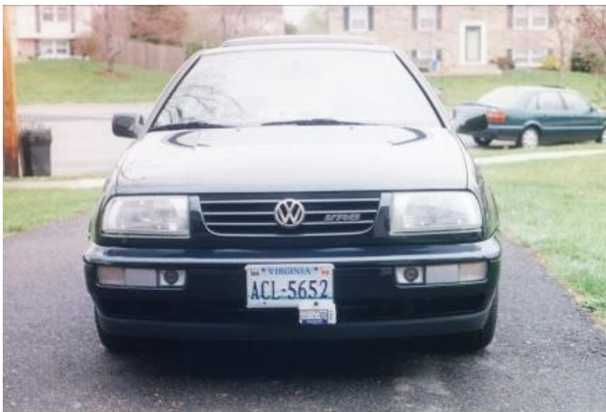
1998 Volkswagen Jetta GLX

Thinking back to a previous Car of the Month article on my 1995 Volkswagen Passat, you might remember it had a VR-6 engine, which was smooth and powerful. I was very impressed with how that car performed. Now put that same engine into a smaller and