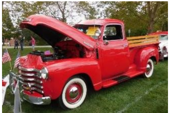
Youth Choice Award: 1947 Chevy Thriftmaster