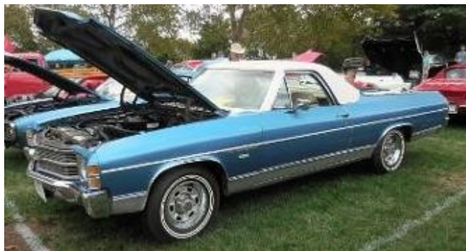
President's Choice Award: 1971 Chevy El Camino