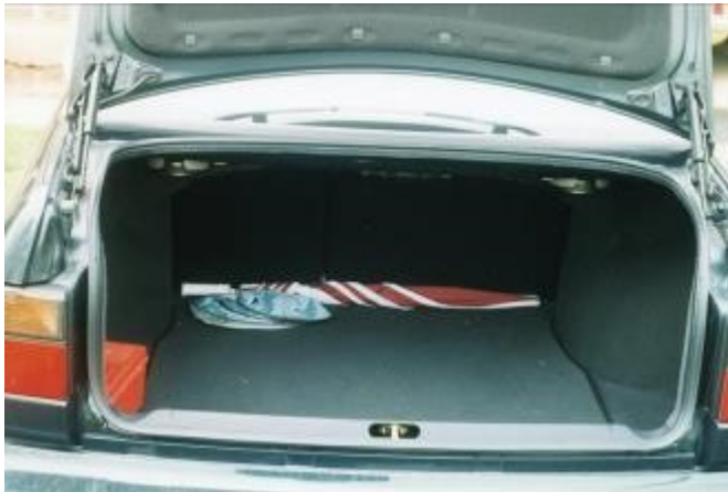
Spacious trunk with fold down rear seat up

sinos, but did not like going alone. So while I was up there, we decided to spend a day in Atlantic City. My father drove us down in the Jetta since his eyesight was failing and he did not drive at night. I did not know how bad his eyesight was. We were heading down the Garden State Parkway when I looked over to him and said, "Dad, why are you driving so fast?" He responded with, "I'm not. I am doing 60 (mph)." I said, "No you're not." To which he replied, "Yes, I am. The speedometer needle is pointing straight up and that is 60!" I look at him and said, "Dad, this car has a 160 mile per hour speedometer. You are doing 80." He could not read the numbers on the speedometer, and, being used to the 120 mile per hour speedometers of American cars, he figured he was doing 60 when the needle pointed straight up.