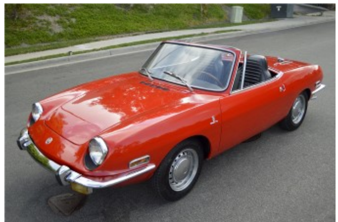
FIAT 850 Spyder