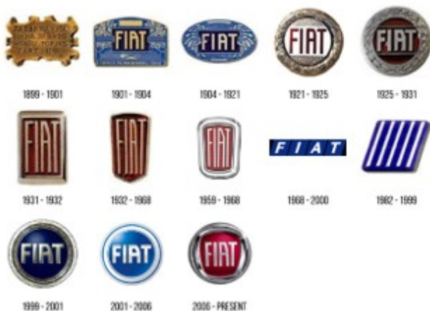
FIAT logos throughout the years

The badge has changed over the years following the trends of the times. In the 1960s, the surrounded letters were dropped in favor of just the letters. This variant lasted 23 years in different forms until 1999