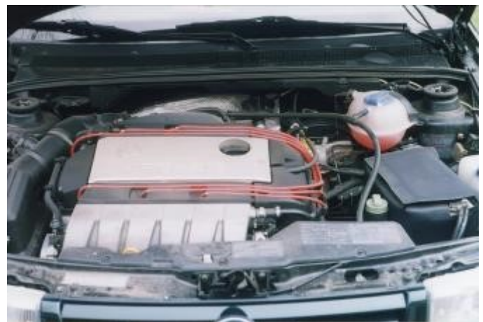
Smooth and Powerful VR-6 Engine

whenever I went up to New Jersey where he lived. On one of his trips down to Virginia, Dad was leaving a toll booth on the NJ Turnpike when out of nowhere an object went skittering across multiple lanes right in front of him. With no time to react, he ran over the object and the car stopped dead in its tracks.