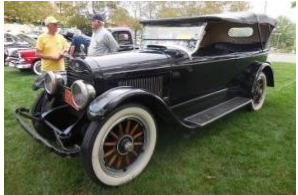
Rohr Trophy: 1921 Lincoln Touring Car