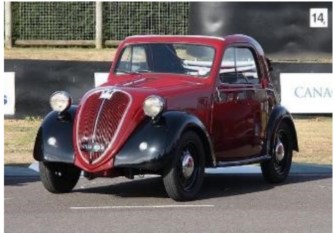
193 FIAT Topolino

The most recent incarnation, from 2007, includes a thickly bordered red box with the four capital letters in a style reminiscent of the one used in the 1930s.