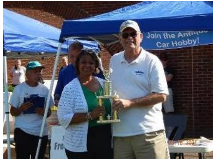
Presenting the Mayor's Choice Award