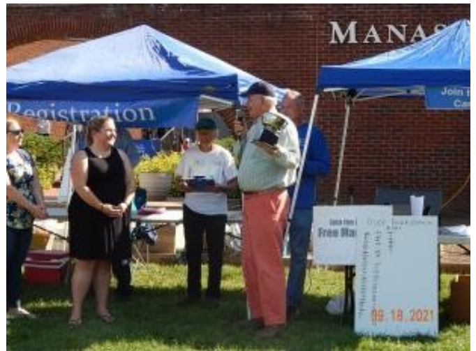
Presenting the Rohr Award