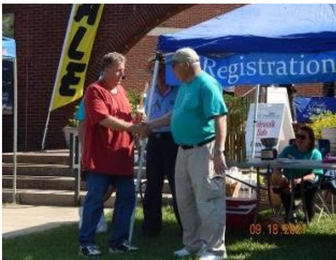
Presenting the President's Choice Award