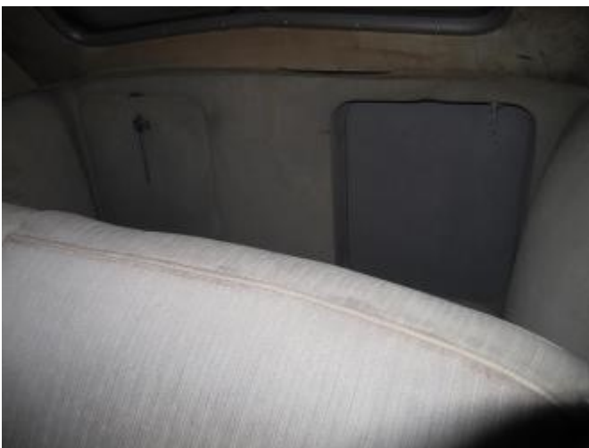
Picture of rear jump seat

At another time, Bull Run Region did a tour up on the Skyline Parkway. All was great until a snow storm caused us all to get off the Blue Ridge Mountains and find shelter for the night. Well we finally got off the mountain but not without a lot of prob-