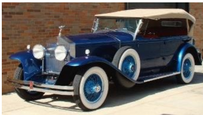
1927 Phantom I Touring Car

His presentations will cover the history of Rolls-Royce from the early 1900s to the present. The June