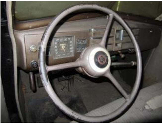
LaSalle dash and steering wheel