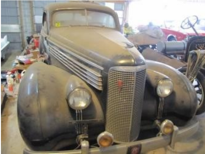
Front view featuring massively long hood