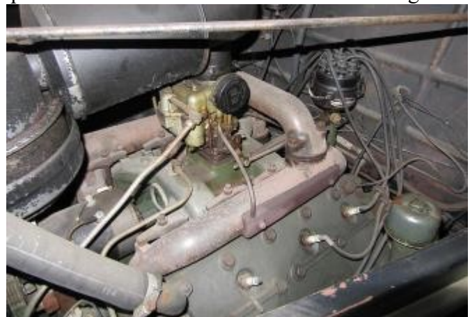
Left side of Cadillac V-8 engine

The LaSalle is basically a two-person coupe, but it does have two fold down jump seats behind the front seat. It is powered by a 322 cu. in. Cadillac V-8 engine making 125 horsepower. The car sits on a 124 inch wheelbase and has a column mounted three speed manual transmission. The car is waiting to