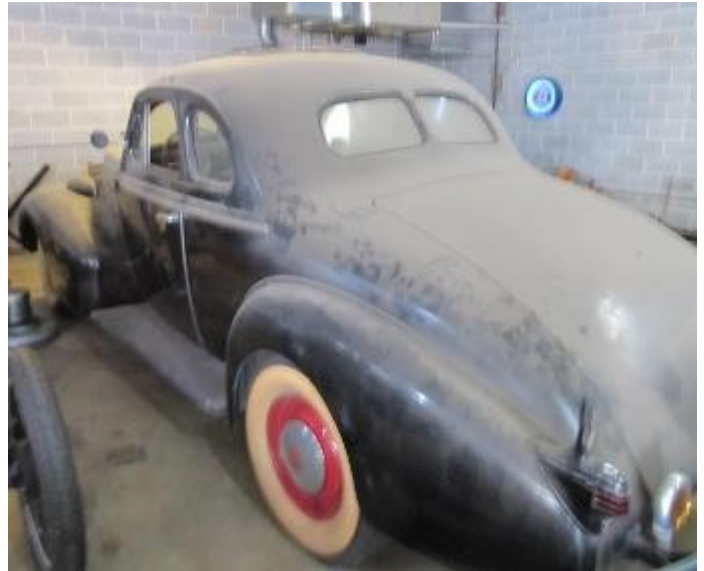
Rear view with added directional lights