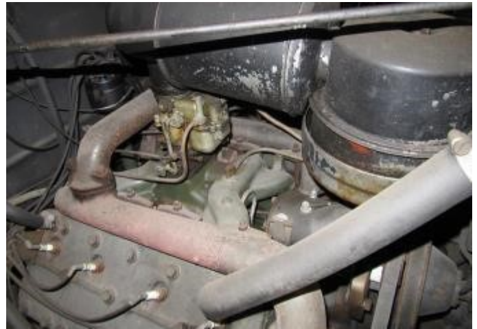
Right side of Cadillac V-8 engine