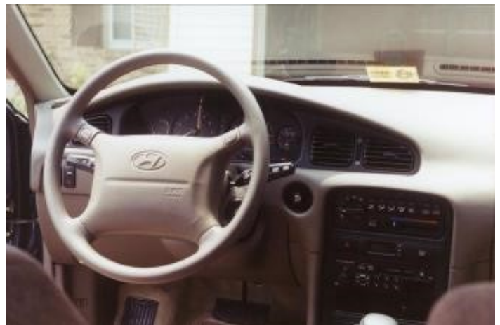
Dash with altimeter at the center

A few months after purchasing the Sonata, the travel agency she was working for went out of business, so she was out of a job. Fearing not being able to make the car payment due to the loss of income and my impending retirement from the U.S. Air Force, she wound up getting a job as the receptionist at the very same Volkswagen/Hyundai dealership in Manassas where we purchased the Sonata. They quickly realized she was far too talented and capable to remain the receptionist, they made her the warranty administrator at a substantial pay increase. She remained a warranty administrator for the rest of her working