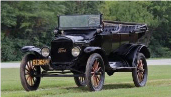
1917 Ford Model T Touring Car

Between June 15 and August 7 of 2019, Thetan Ogle covered 10,000 miles and traversed 33 states in his 1917 Model T Ford touring car.