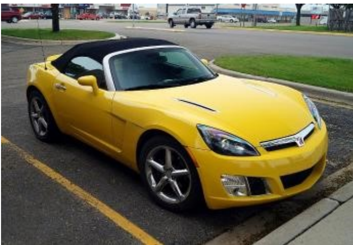
Saturn Sky Red Line

The cars had rear-wheel drive and offered a choice of 2.0 or 2.4 liter all-aluminum inline 4-cylinder en-