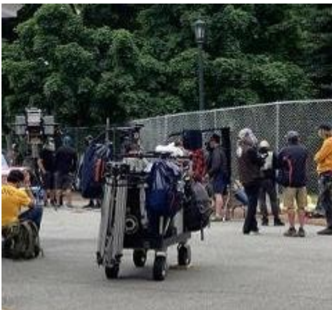
Film crew staging equipment

The TV show stars Michael Keaton, Rosario