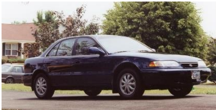
1995 Hyundai Sonata GLS at home in Manassas