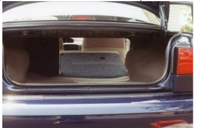
Split fold down rear seats as seen from the trunk.

Unlike most of our cars, this one has no particular interesting story behind it. We rarely used it for family trips. It was basically a back and forth to work and errands car. The car actually lived up to its hype. It was a well-built vehicle and virtually trouble free. It was both reliable and economical to operate. From this point Hyundai's reputation began to improve. So much so, that today it is a highly respected automobile manufacturer. They even intro-