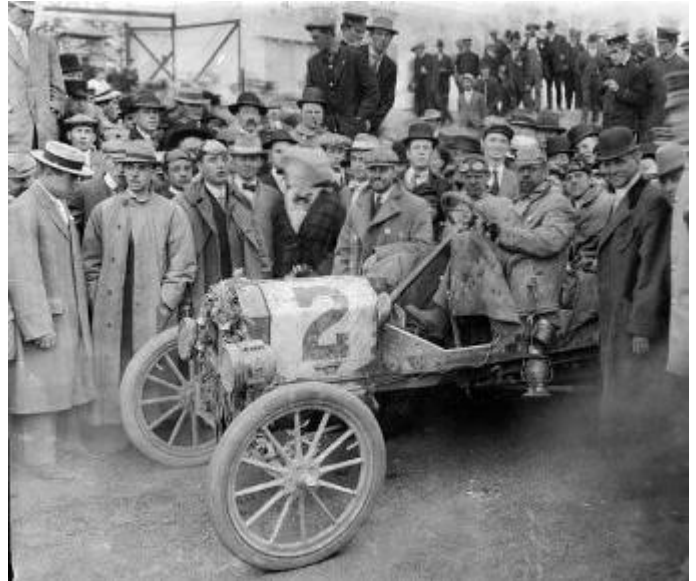
One of the competitors in 1909 Ocean to Ocean Endurance Contest