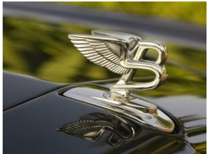
Early Bentley Mascot

Both the Bentley logo and mascot have undergone subtle changes over their 102 year history. The number of feathers on the logo varied between 10 and 15 per side. On any given logo the number of feathers were not equal on each side with the left side usually having one less feather. The wings on the mascot