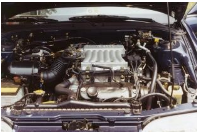
Transverse mounted 3 Liter V-6

life, working for several dealerships in Northern Virginia, eventually becoming the highest paid warranty administrator administrator in the state.