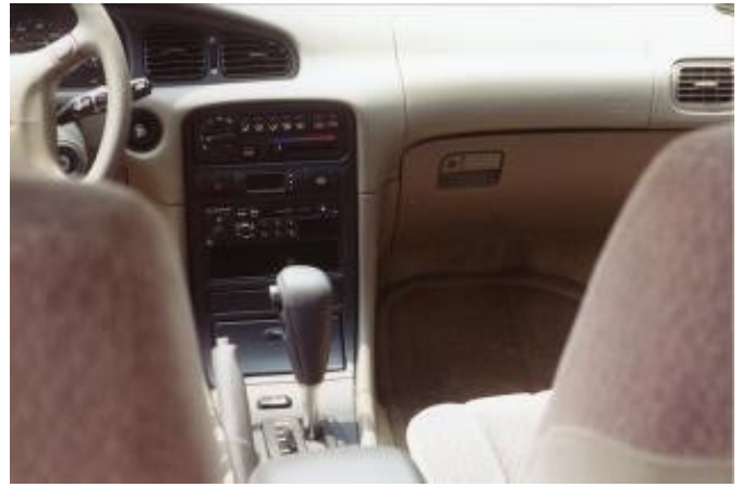
View of center console

Unlike most of our cars, this one has no particular interesting story behind it. We rarely used it for family trips. It was basically a back and forth to work and errands car. The car actually lived up to its hype. It was a well-built vehicle and virtually trouble free. It was both reliable and economical to operate. From this point Hyundai's reputation began to improve. So much so, that today it is a highly respected automobile manufacturer. They even intro-