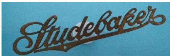
Initial logo used from 1902 to 1917