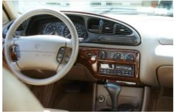
Interior view of dash