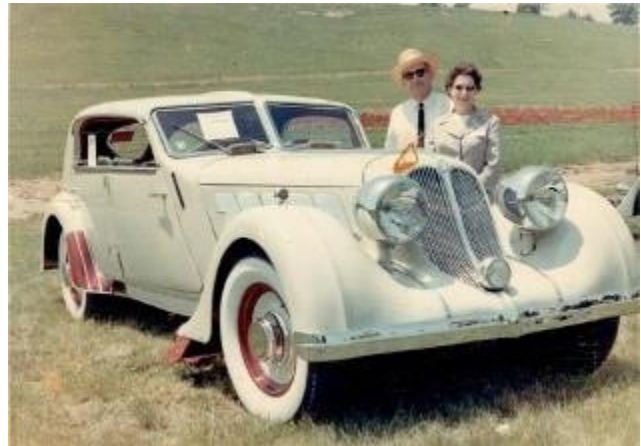
1933 Rohr Automobile from Germany

ern Virginia. In coming years he helped found the Chamber of Commerce, became fire chief, was elected to the City Council and became mayor of Manassas.