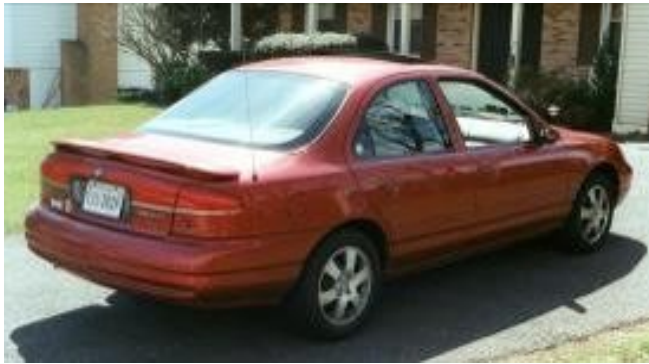
At home in the Manassas driveway

We purchased the Mercury for just under $16,000, as this was the highest trim level for a Mystique, and it had low mileage. As an LS model, this car came with a 2.5L V-6 engine producing 200 horsepower, while lesser models came with a 2.0L four cylinder engine. The engine was paired with a 4-speed automatic transmission, power steering and four wheel disc brakes, ABS of course. On the inside, the Mystique was appointed with an AM/FM/CD stereo radio, power windows, cruise control, air conditioning, moon roof, leather interior, and faux wood dash trim. The LS added standard fog lights and remote key access.