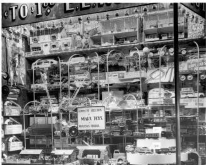
Inside the Rohr 5 and 10 Cent Store