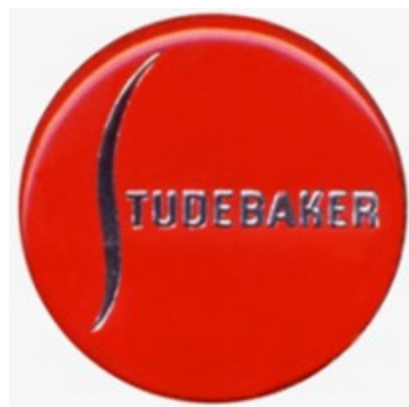
Art Deco logo used from 1935 to 1963

featured by the logo in the years 1964-1968. Loewy's later design was distinctive and yet simple in form. Once people connected it with the Studebaker name, they were apt to remember it. Some people make