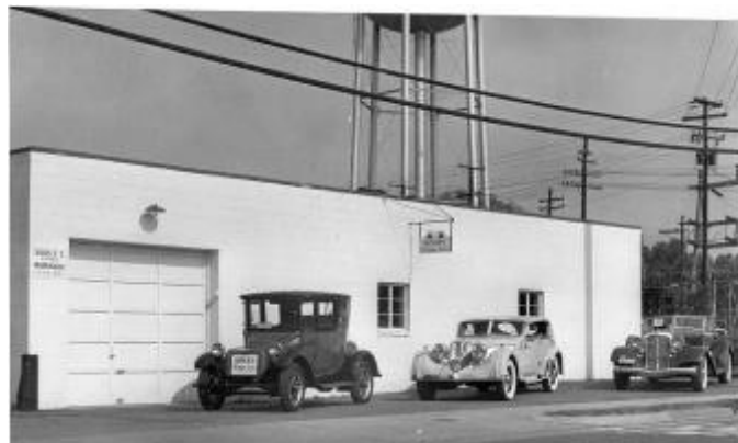
The Rohr Museum in Manassas