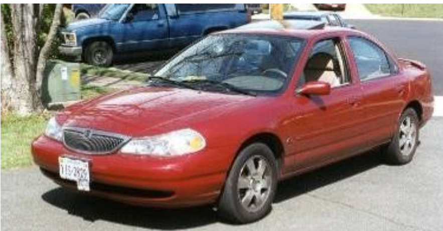
1999 Mercury Mystique LS

In the year 2000, my wife, Pam, purchased a new Dodge Durango SUV. It was a good vehicle being a little larger than the other mid-sized SUVs on the market. It came with the usual 4.7L Magnum V-8 which tended to guzzle gas like a full size SUV. This was of little matter as she was working only a few miles from home and there was a big parking lot at her workplace. Then she was given a marvelous opportunity to work at at Rosenthal Infinity at a significant pay increase. The issue was the dealership was in Tysons Corner, a good 20 miles from home in heavy traffic. Also the employee park-