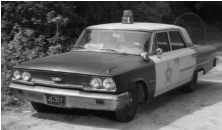
Speeders beware! Sheriff Andy is waiting

Among the evening's topics will be an overview of the most popular television cars of the 1950's and 1960's and a discussion of the iconic Southern California car customizers and their influence on generations of TV viewers, especially car enthusiasts.