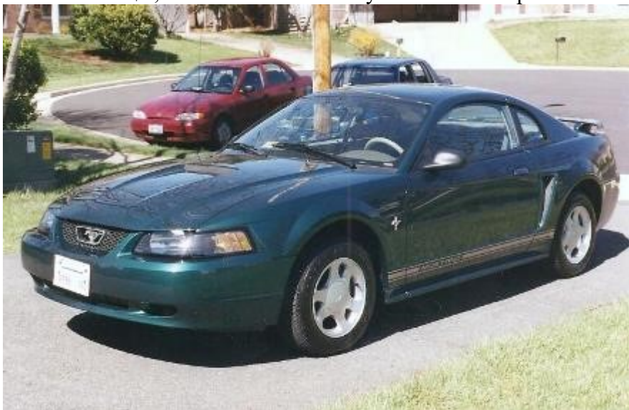
2001 Ford Mustang Coupe that joined the corral with my 1973 Mustang Mach I