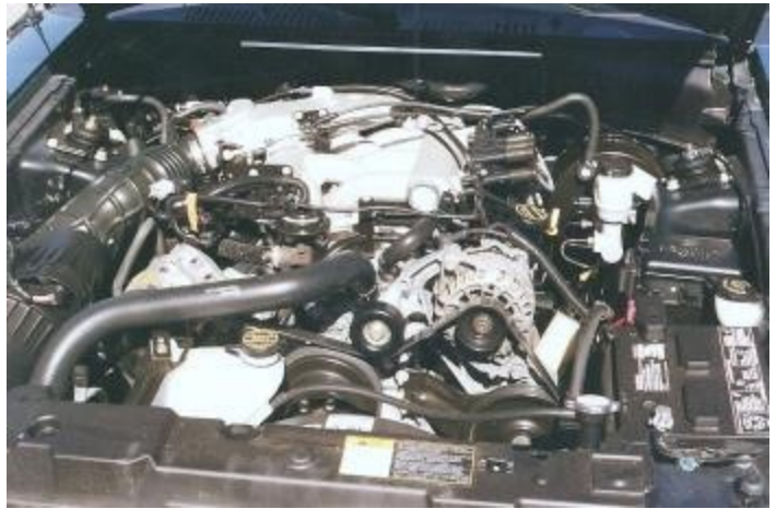
The Mustang's powerful V-6 engine

problems, but rather operator error. While driving to work, Phillip took a curve too fast and sideswiped a guardrail damaging the right side. We got that repaired. A few months later he rear ended a car in a parking lot. That minor damage was repaired quickly. In time for Phillip getting broadsided while turning into a parking lot. That bent the frame and totaled the car. The bottom line is we had the right idea, but unfortunate execution.