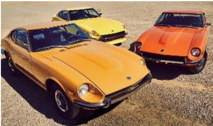
The 240Z (foreground) with two of its successor "Z" models