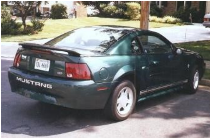
Rear view with Mustang decal on bumper

The car ran like new and was fun to drive. It provided reasonable fuel economy and was quite comfortable, at least in the front seats. Phillip was the envy of his friends, but alas this car did not last very long either. Its short tenure was not due to mechanical