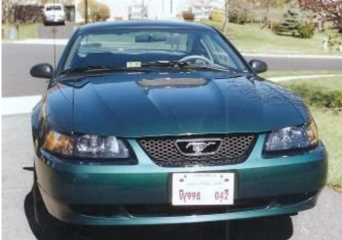
Front view of the 2001 Coupe