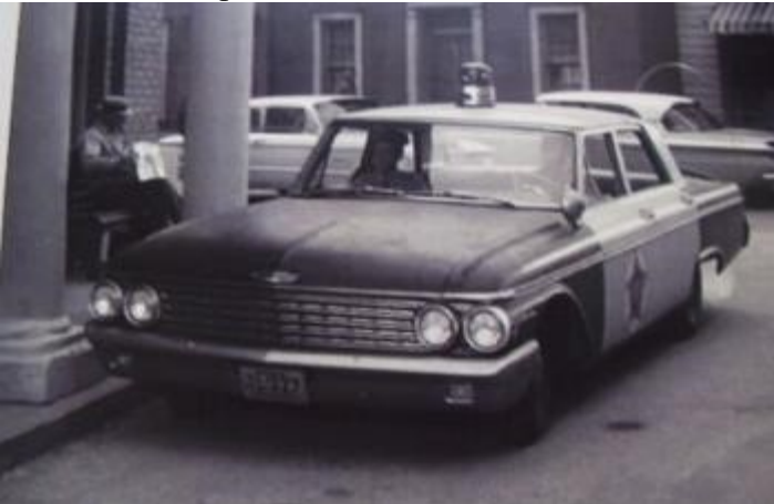
Andy and Barney at the courthouse