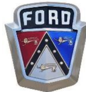
1950s Ford script in Coat of Arms

They all have undergone minor changes, such as making minor alterations to the Ford inscription and making the oval a little rounder.