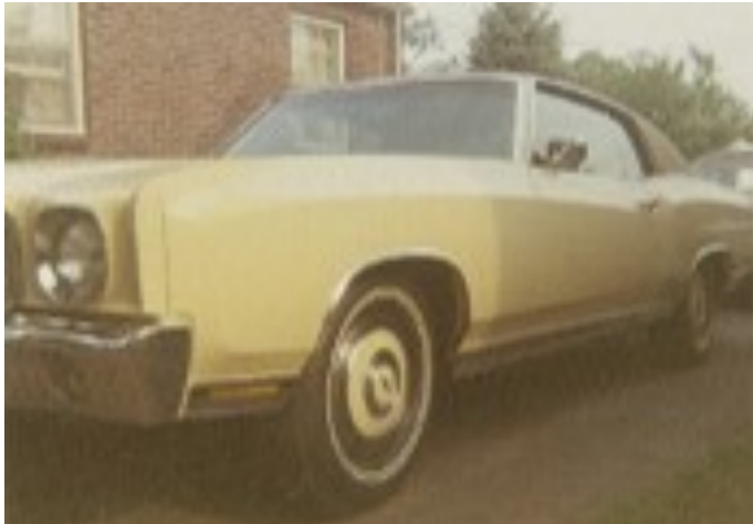
At home in the New Jersey driveway

Clearly, this was not the car my father wanted, but rather one he was settling for. Before he pulled the trigger on the deal, I suggested he look at the new model Chevrolet was putting out that year, the Monte Carlo. The three of us walked into the local Chevy dealer in the next town and there it was. A beautiful yellow with tan vinyl roof Monte Carlo sat in the middle of the showroom floor. My father and I fell in love immediately. My mother was less enthusiastic. She did not like the fact it was a two door car, the back seat was too cramped, which she felt she would be relegated to when all three of us were together, and the trunk was too small. She did like the color and the air conditioning. I pointed out that I would be off to college in a year and she would have the front seat most of the time. This sealed the deal, but I suspect my mother saw my father light up when he saw and drove the car, and since the Rambler would be hers, she gave in.