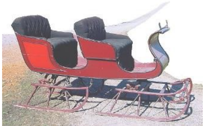
1837 Studebaker Sleigh

Activities over the past few days have motivated me to research what is perhaps the most enduring and endearing vehicle of the past century and a half. Santa's Christmas sleigh is one of the many icons of the season, but why 1837. Saint Nicholas, aka Santa Claus, has been around for centuries, but did you know he did not use a sleigh until 1821? This was most likely a rental since it was needed for only one night. Prior to 1821 Santa used various forms of transportation to include walking and even riding a goat.