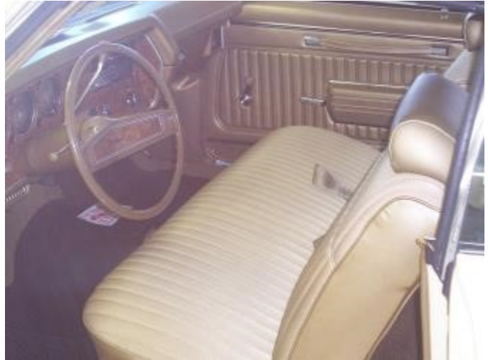
Interior view of dash and front seat

That night my father and I were driving back home from some function that I do not remember. He thought this was be a good time to let me try driving the Monte Carlo as I had just been granted my driv-