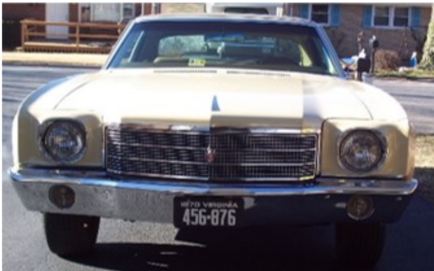
1970 Chevrolet Monte Carlo front view

My father's 1970 Monte Carlo was the first automobile purchase in which my opinion had any true impact. Our Monte Carlo started out as a 1970 Pontiac Executive. Never heard of a Pontiac Executive?