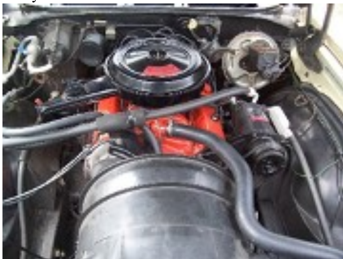
GM 350 cu. in. V-8 Engine and fan tunnel

My father used this car for many years. In 1980, he received a clear signal that it was time to let go of the Monte Carlo. Leaving his workshop one rainy day, he discovered his precious car half under water. The Hackensack River had flooded and filled the parking lot with about four feet of water. The car sat and soaked for days as the river slowly went down to its normal level. Attempts to dry out the car were fruitless so my father took the insurance money and bought a 1980 Buick Skylark. We always look back fondly to the Monte Carlo.