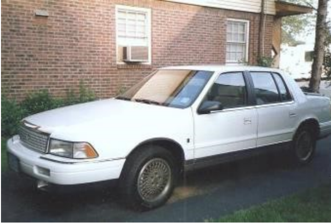
Left side view of the Acclaim

My mother paid $14,000 for her new car. The dealership was running a special promotion for qualified buyers of zero percent interest for two years. Her brilliant son, no not my brother I am an only child, who was with her to make the deal advised her to take the offer even though she had the full sum available. I explained that her money could stay in the bank and earn interest while incurring no interest on her loan. It was free money! She agreed and made the purchase. Needless to say my father did not like