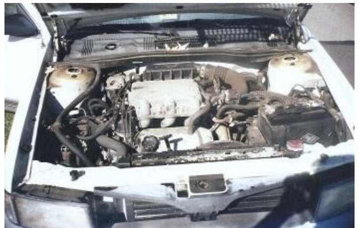
3.0 L Mitsubishi v-6 engine

The car served my parents well. By 1995 the paint began to flake off the hood and the trunk. While there may have been a paint/clear coat issue, as was prevalent in the late 1980s and early 1990s, the acid rain and pollution of northern New Jersey did not help the issue. My mother passed away that year from cancer and the Acclaim became my father's primary car. In the year 2000, my father got the itch