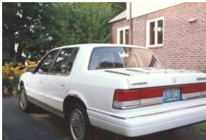
Rear view note the luggage rack on the trunk lid.

Regardless, the car was much nicer than the Reliant. In addition to the V-6 engine with automatic trans-