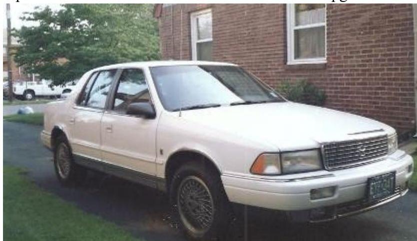
1989 Plymouth Acclaim in Dumont, New Jersey

In 1981, my mother bought a new Plymouth Reliant the first year for the venerable K-car series. It provided good, basic transportation at a reasonable price. It had a 2.5 liter inline four cylinder engine which made the car slow and produced a noticeable vibration to the steering wheel and column when at idle. By 1989, she decided she was ready for an upgrade. So after some shopping around, she decided on a Plymouth Acclaim from a local dealership. What she did not realize was this was not an upgrade. In its